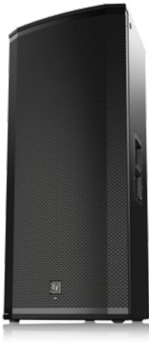
35 ETX-35P 15" THREE-WAY POWERED LOUDSPEAKER