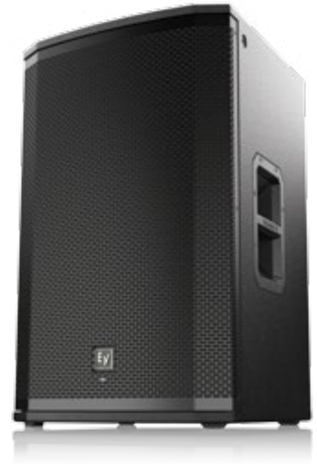
15 ETX-15P 15" TWO-WAY POWERED LOUDSPEAKER