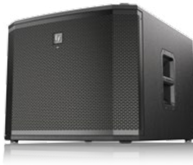
15 SUB ETX-15SP 15" POWERED SUBWOOFER