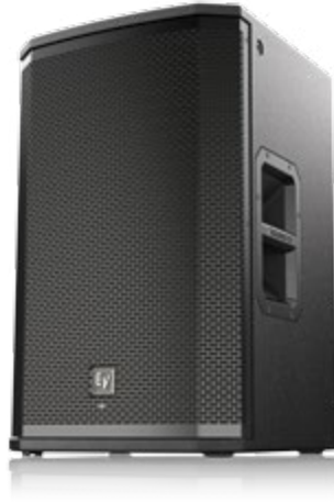
12 ETX-12P 12" TWO-WAY POWERED LOUDSPEAKER