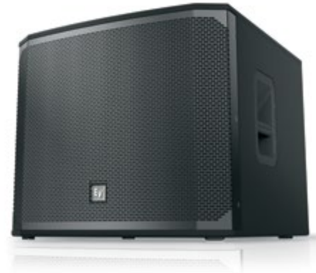
18 SUB EZX-18S