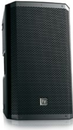
12 ZLX-12 12" TWO-WAY PASSIVE LOUDSPEAKER

Big sound doesn't need to take up a lot of space. Ideal for main loudspeaker or monitor wedge duties, the ZLX-12 offers the ultimate combination of performance and portability – and always looks great on stage.