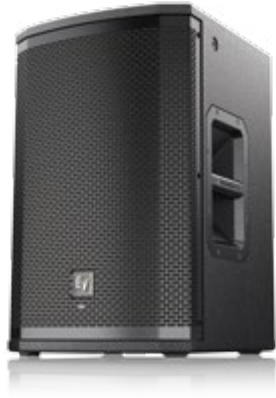
10 ETX-10P 10" TWO-WAY POWERED LOUDSPEAKER