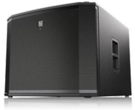
18 SUB ETX-18SP 18" POWERED SUBWOOFER

18" DVX woofer for extended low-frequency response