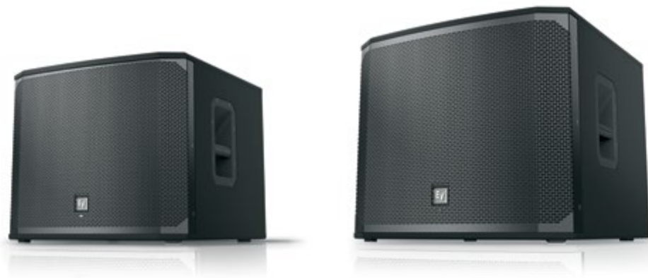
15 SUB EKK-15SP 15" POWERED SUBWOOFER