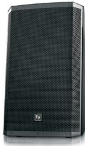
15 ZLX-15 15" TWO-WAY PASSIVE LOUDSPEAKER

The ZLX-15 gives you the confidence of the industry's most trusted components – engineered to exacting standards to bring exceptional EV audio quality for larger applications, with or without a subwoofer.